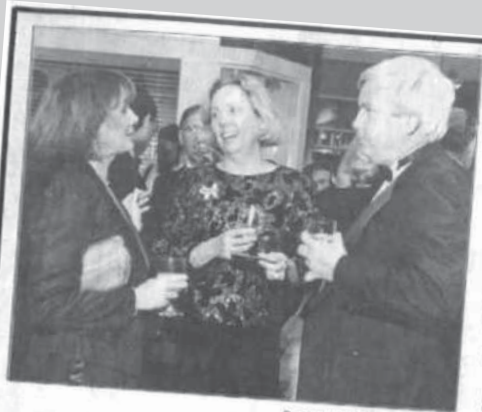
Record photo by J.S. Carras